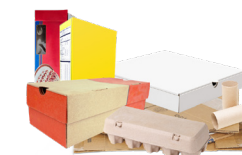
Cardboard and boxboard