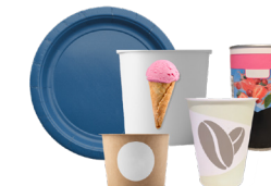
Paper laminate packaging